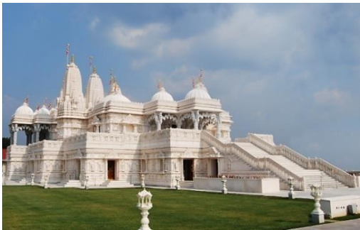
Shri Swaminarayan Mandir, Atlanta, U.S.A.