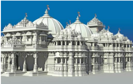
Akshardham Temple, New Jersey, U.S.A.