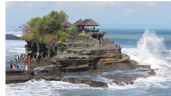
Tanah Lot Temple, Bali, Indonesia.