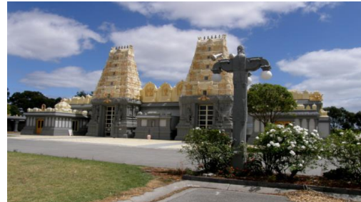
Shri Shiva Vishnu Temple, Victoria, Australia.